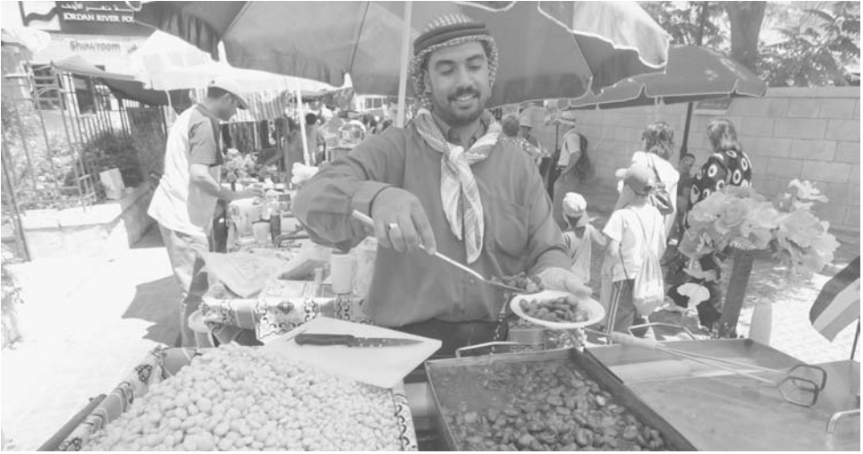
A vendor sells foul (cooked fava beans) in a market in Amman, Jordan. Foul is one of the most popular street foods across the Middle East and North Africa.

port of Aqaba. Goat is eaten on occasion, though most goats are kept for milk. Eggs, milk, yogurt, cheese, fava beans, and chickpeas are other important protein sources.